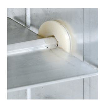
Parallel blade with extruded lip for low leakage.