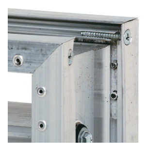
Durable construction riveted and screwed corners.